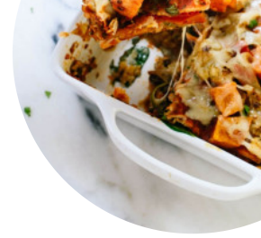
Table 85 Menu