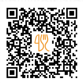
S.o. Qun Menu

https://menulist.menu 1587 Saint Denis St, H2X 3K3, Montreal, Canada, Montréal +15142861288 - http://sogunfusion.com/